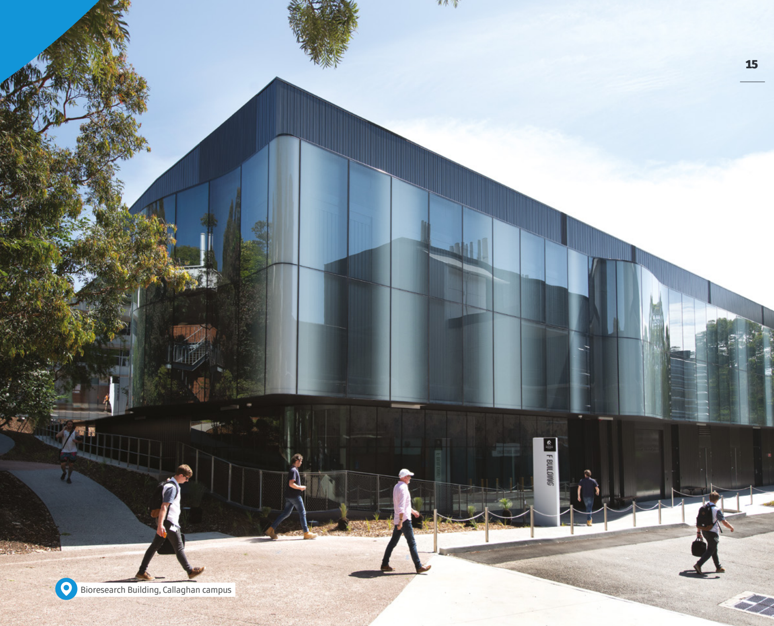
Bioresearch Building, Callaghan campus