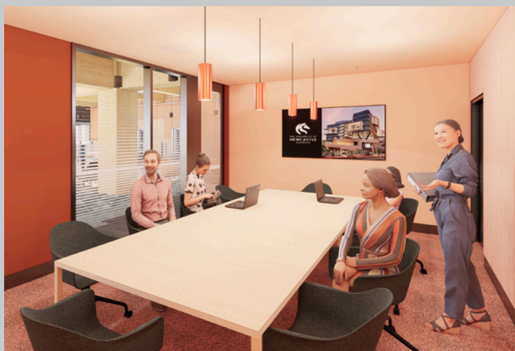
Table box for laptop display connectivity