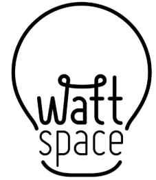
EXHIBIT AT WATT SPACE GALLERY