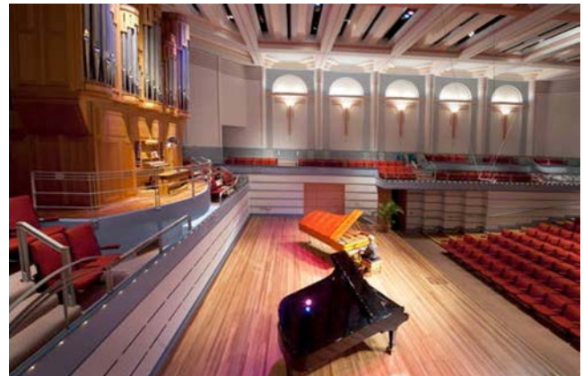
Interior images: Harold Lobb Concert Hall