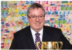
Bruce Gosper, Australian High Commissioner to Singapore