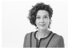
Jo Tyndall, New Zealand High Commissioner to Singapore