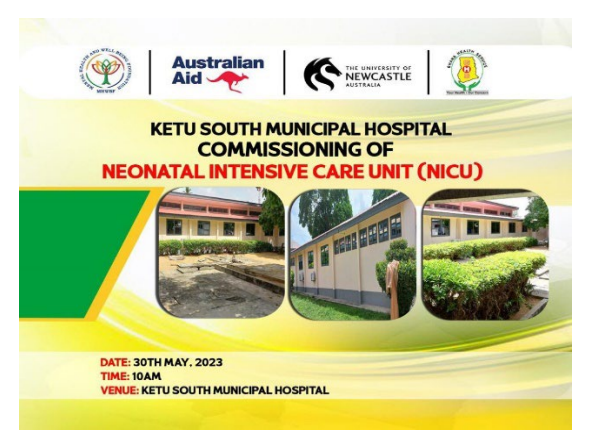
The neonatal unit commissioning banner with UON Logo