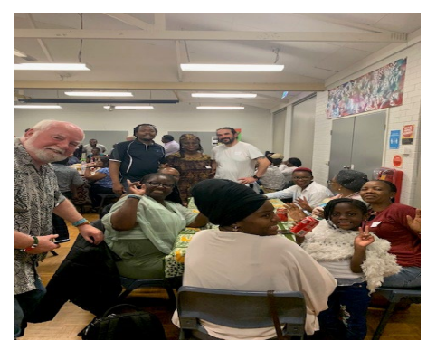
UON/DFAT African Delegates at Community Dinner organised by Hunter Botswana and Kenya community members.