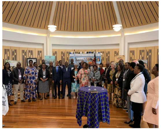
At the Bostwana High Commission in Canberra, joint hosting of delegates by the Botswana and Kenya High Commissions