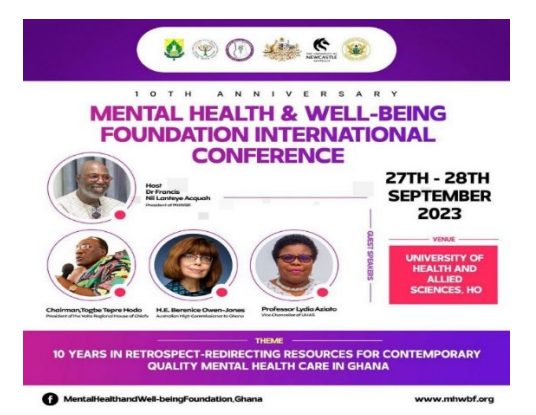
UON/CARE-P and MHWBF tenth anniversary call with UON Logo

CARE-P and the MHWBF have raised funds and worked together to construct a well-equipped Neonatal Intensive Care Unit (NICU) at Ketu in Ghana. The NICU had larger space and is equipped with vital resources, including a ventilator, three radiant warmers, five incubators, oxygen concentrators, twelve cots, cardiac monitors, phototherapy equipment, infusion pumps, and a medication trolley. The facility also includes dedicated areas such as a mother's wellness Centre for counselling, a Kangaroo mother care area for preterm infants, a spacious breastfeeding area for bonding, and essential facilities for the medical staff. The impact of this project is significant. It will allow for increased admission of newborns, reducing the risk of cross-infection, and enhancing ward safety through proper equipment placement and demarcation. Additionally, the mother's wellness Centre within the NICU will provide mental health and wellness support to anxious and depressed mothers, ensuring comprehensive care for both infants and parents. This project will immensely contribute to the UN's Sustainable Development Goal 3.2 to end preventable deaths of newborns and children under 5, and to reduce neonatal mortality to at least as low as 12 per 1,000 live births by 2030. Her Excellency Ms Bernice Owen-Jones opened the neonatal Unit for Ketu district residents in Ghana. The facility bears a plaque that has the UON logo as acknowledgement and advertisement.