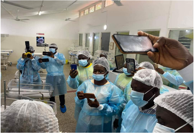
A ward at the neonatal unit.