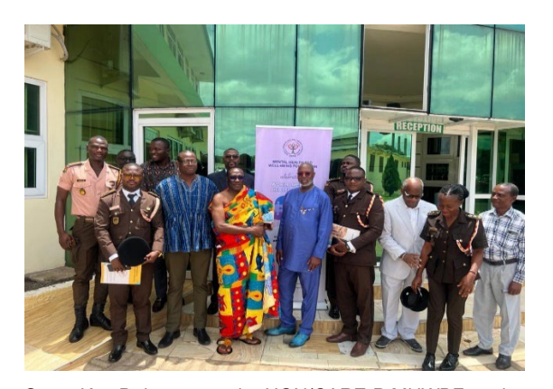
Some Key Delegates at the UON/CARE-P MHWBF tenth conference in Ho Ghana.