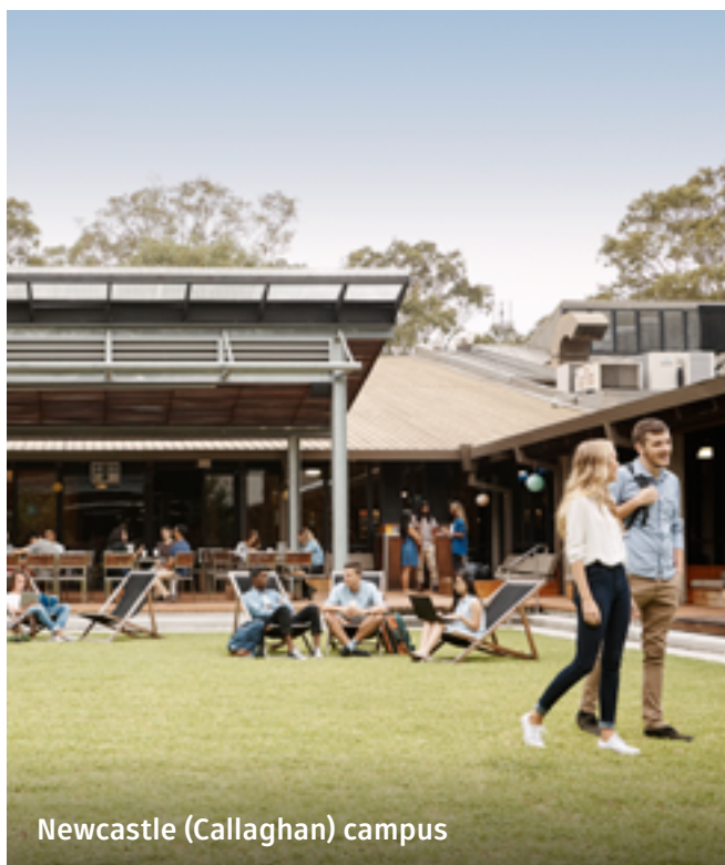
Newcastle (Callaghan) campus

The beautiful city of Newcastle is known for its spectacular coastline, its contemporary culture and enviable lifestyle. National Geographic has named Newcastle as one of the world's 7 Smart Cities that have risen to the challenges of 21st century urban life.