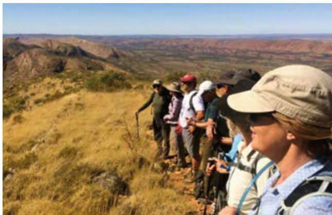
Larapinta trekkers enjoy the stunning views.

Ready to put your best foot forward in 2017? We're looking for 30 volunteer champions to embark on an impressive and worthwhile adventure from 15-19 August: a 65km, five-day trek along the magnificent Larapinta Trail in the Northern Territory.