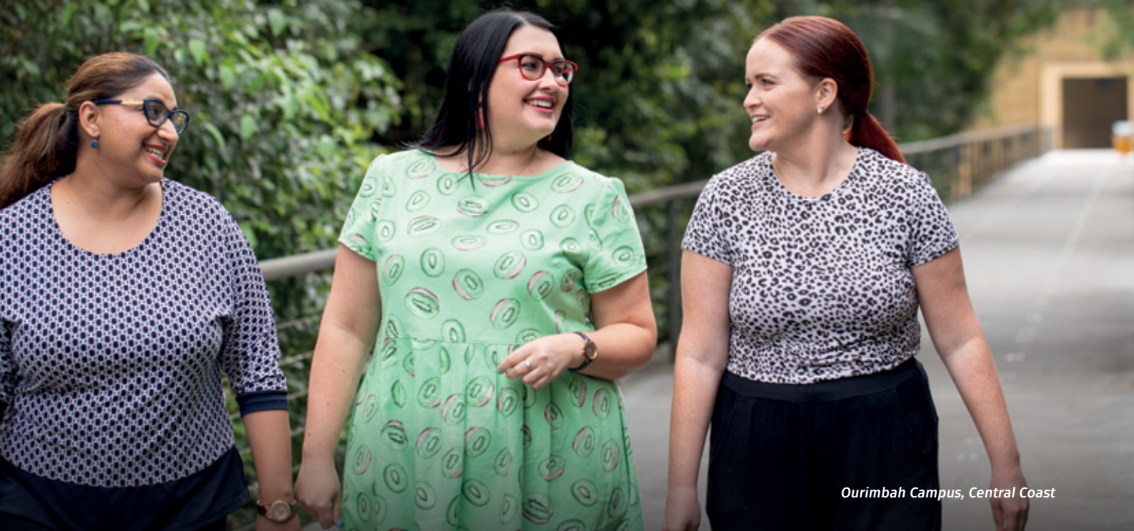
Ourimbah Campus, Central Coast