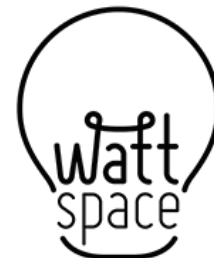
EXHIBIT AT WATT SPACE GALLERY

Any current student from the University of Newcastle is eligible to apply to exhibit at Watt Space.