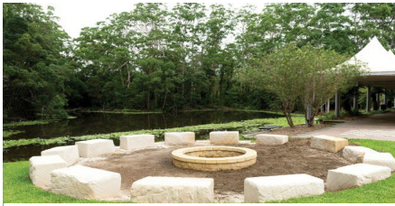
nganggali ngara ngura (Darkinyung language for Talking Listening Place) Ourimbah Campus