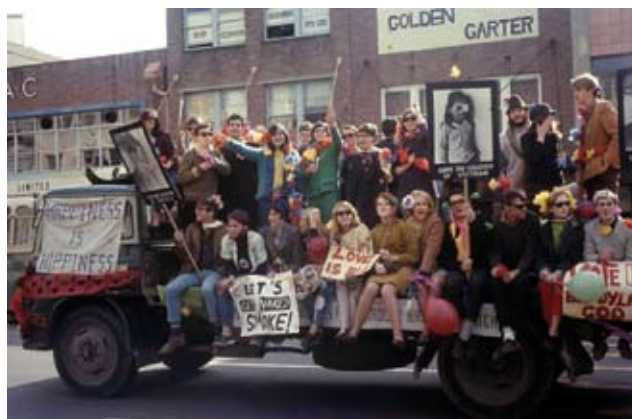
This photo of University of Newcastle's Autonomy Day Parade in 1967 is just one of the photographs on display for History Week 2007.

Everyone is welcome to visit the exhibition, and, if you can't come in person, you can visit online at http://www.flickr.com/photos/uon/sets/72157600672159851/